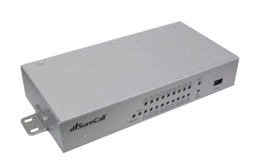
Model # SC-Sentry