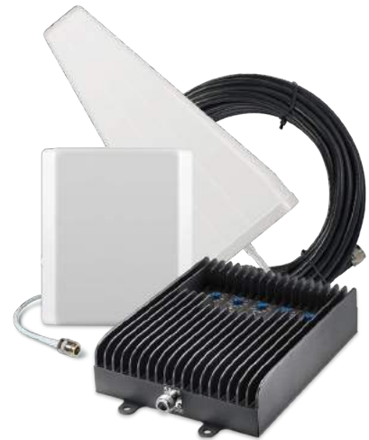
SureCall Fusion5s Yagi/Panel kit

4. Panel antennas provide directional indoor coverage.